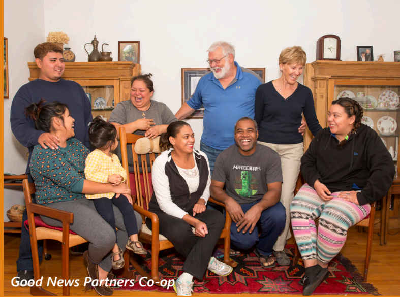
Good News Partners Co-op