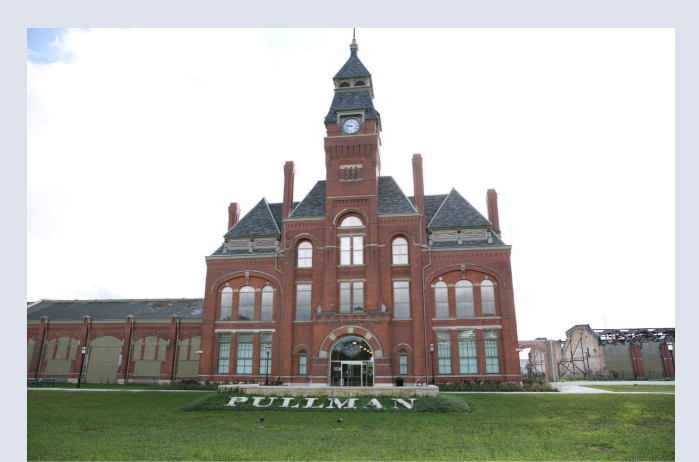
Pullman Visitation Center

community for his workers -- one of the first of its kind in the nation. Pullman would be a community with access to parks, schools, churches, educational programs, a theater, a library and various other amenities -- things that other communities in Chicago did not have. He also wanted a location to erect a new manufacturing plant to build his popular "Pullman Palace Cars" for the burgeoning rail travel across the nation.