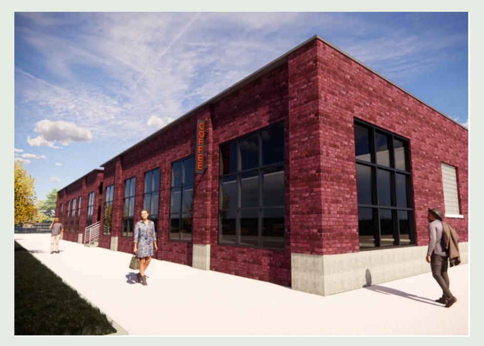
Rendering of future home of Sputnik Coffee

According to a 2015 groundbreaking study conducted by Technomic for the National Coffee Association, 76% of American adults drank coffee either at home or at one of the one million foodservice venues in the United States.