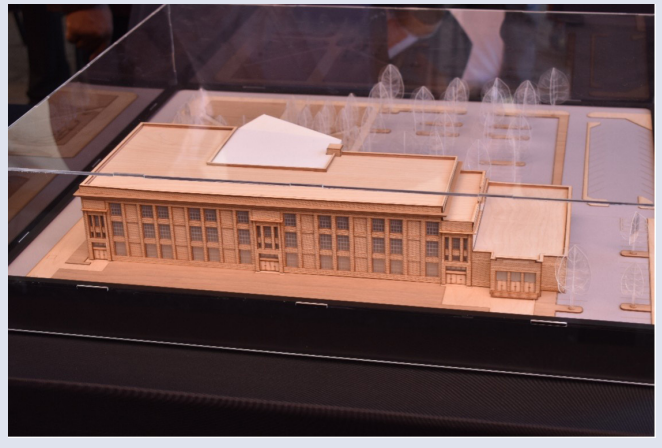
Mockup of the ASPIRE Center

In the Austin community, four schools were shuttered, but one recently found a new purpose. The former Emmet Elementary School at 5500 W. Madison will now be the ASPIRE Center.