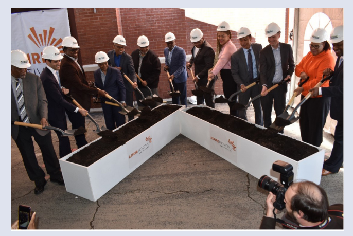
Groundbreaking for the ASPIRE Center

CCLF provided a $3,333,333 loan to help bridge a state grant and leverage New Markets Tax Credits. Others who financed this project were IFF and Enterprise Community Loan Fund.