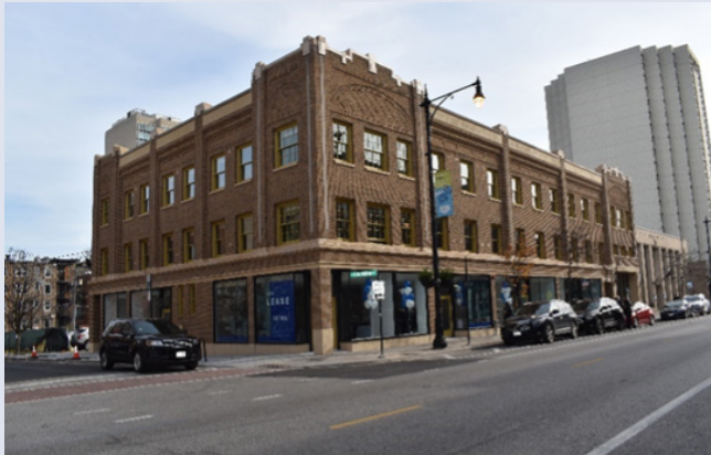
The Covent Apartments 2023

Living in a big city can be expensive. Apartments in Chicago are at a premium, especially in neighborhoods like Lincoln Park on Chicago's North Side.