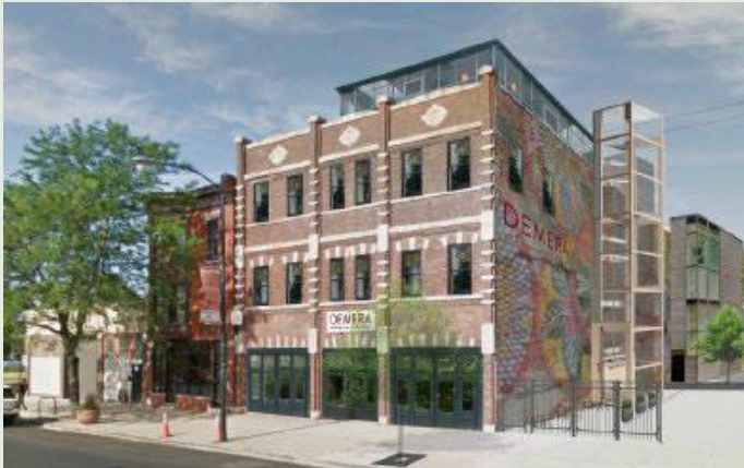
Rendering of Demera Ethiopian Restaurant in Bronzeville

Chicago is known worldwide for its exceptional cuisine. According to Travel and Leisure, Chicago has 50 James Beard Award winning restaurants and more than 20 Michelin-star-award winners.