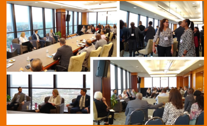
COZC Consortium in Pullman

The event presented a unique opportunity to connect and explore how the Opportunity Zones tool is helping to advance diverse, high-impact community development projects within the Chicagoland area. In addition, it afforded attendees the chance to network, learn, and connect with industry leaders and community development colleagues; partake in the award-winning cuisine of Pullman's Lexington Betty Smokehouse; learn about the development of Pullman Park; and tour Method's South Side Soap Box production facility. Its new warehouse is used to distribute Method's products globally and was the first Opportunity Zones project to be completed on Chicago's South Side.