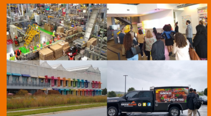
COZC Consortium in Pullman

To learn more about the COZC and peruse its free resources, visit www.chicagolandopportunity.com .