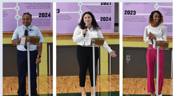
Current and former students of ITVA