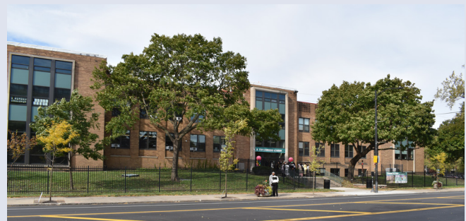
Exterior of ITVA